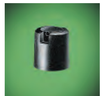
Micro strip spray cap