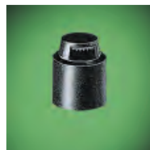
Micro 90 spray cap