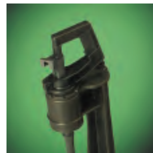
Mini 360 border sprinkler - single