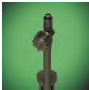
Micro 180 border sprinkler