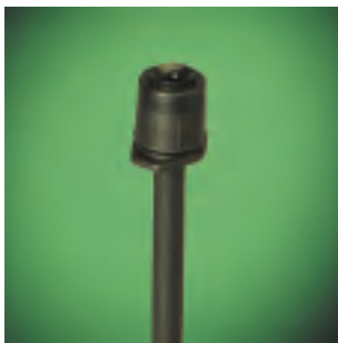
Micro 360 border sprinkler