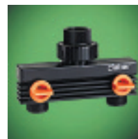
ABS double-tap pack