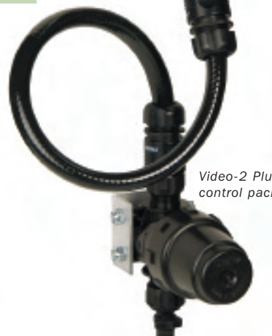
Video-2 Plus control pack