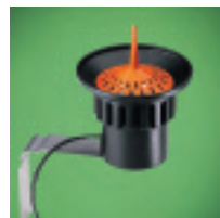
Claber rain sensor

We recommend all timers should be removed from the tap before winter to protect them from frost