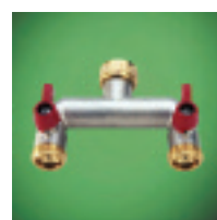
Brass double-tap pack