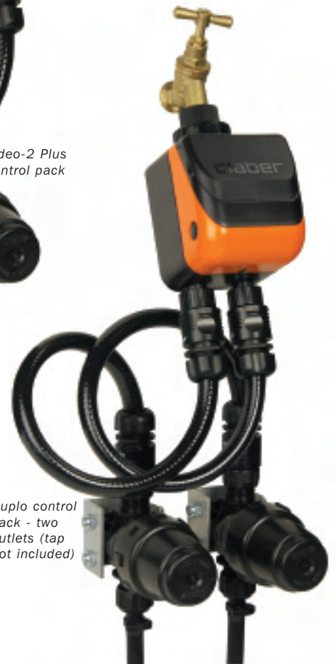
Duplo control pack - two outlets (tap not included)