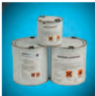
Splice tape adhesive and bonding adhesive