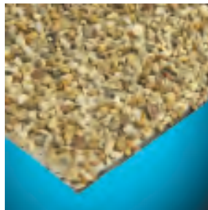
Gravel liner for finishing the edge of ponds