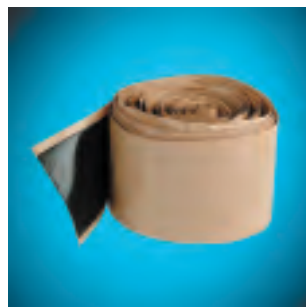
Splice tape for Firestone and Butyl pond liner