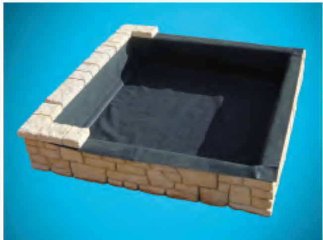
Pre-formed Butyl liner - square