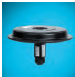
Aqua Series aerator